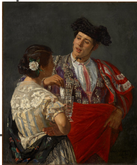
Mary Cassatt, Offering the Panal to the Bullfighter , 1873. Oil on canvas. Acquired by Sterling and Francine Clark, 1947. 1955.1.