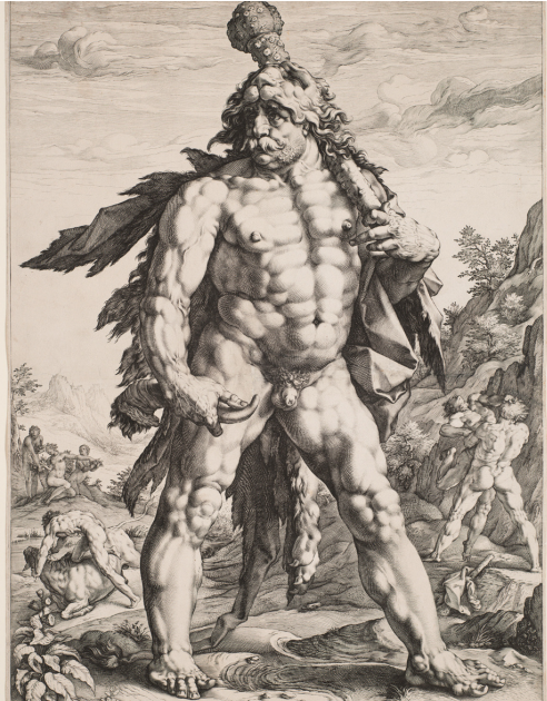
Hendrick Goltzius, The Great Hercules , 1589. Engraving on paper. Acquired by the Clark, 1996. 1996.11.

What is the first thing you notice when you look at this image?