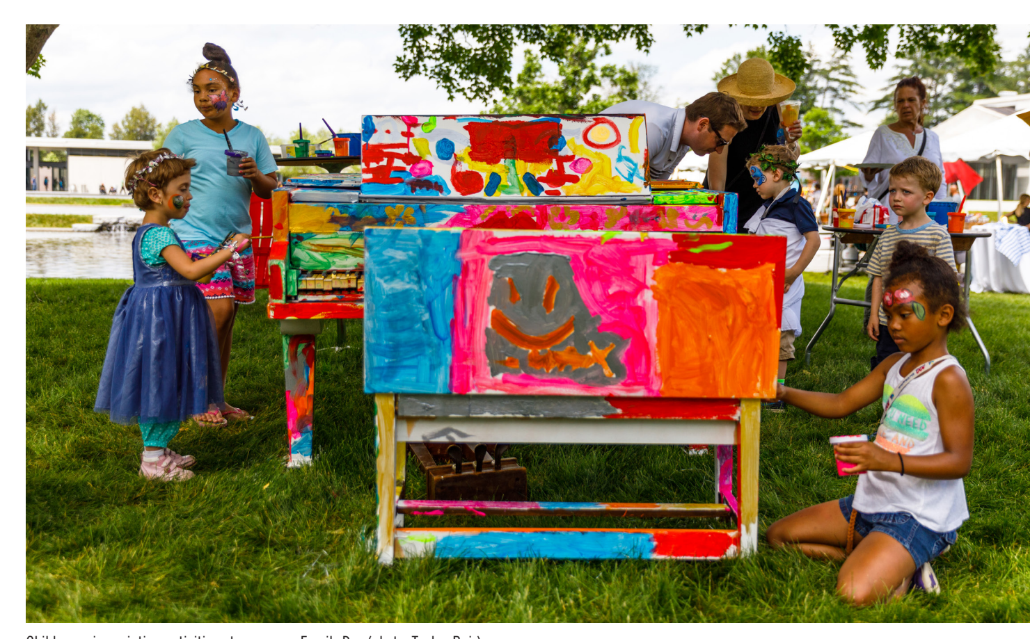
Children enjoy painting activities at a summer Family Day