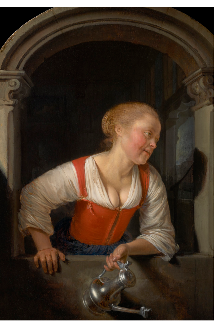
Gerrit Dou (Dutch, 1613–1675), Girl at a Window (detail), c.1655. Oil on panel, Clark Art Institute, 1955.716