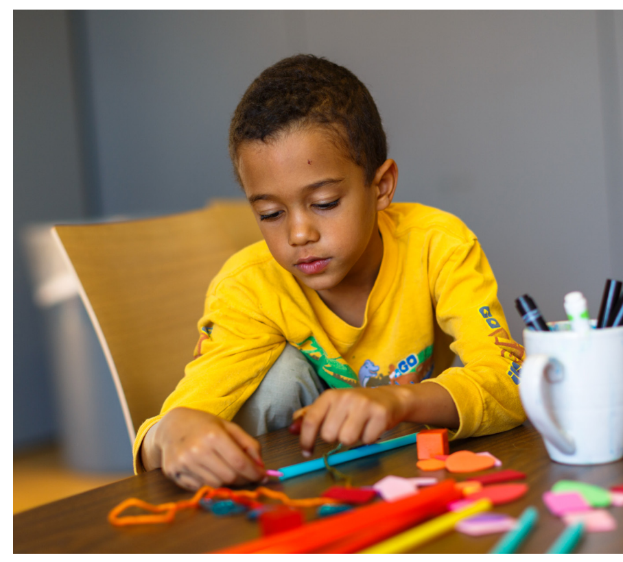
A child participates in the "Start with Art" program

Preschoolers attended a themed gallery talk on flowers and plants, followed by art-making activities.