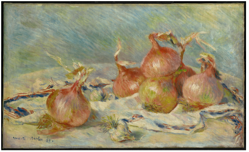
Pierre-Auguste Renoir, Onions , 1881. Oil on canvas. Acquired by Sterling and Francine Clark, 1922, 1955.588.

Concrete poetry involves arranging words on a page to create an image that relates to the subject of the poem. It's like drawing with letters! These two still life paintings feature objects with distinctive shapes that are perfect for concrete poems. Start writing by thinking of phrases that best describe your object, and then enjoy experimenting with the colors and spacing of the text to make your poetic picture come to life.