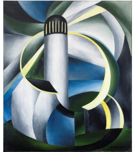
Variation on a Lighthouse Theme IV , c. 1931-32. Oil on canvas, 20 x 17 in. Jeri L. Wolfson Collection