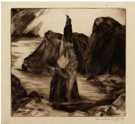
The Oregon Coast , c. 1937. Drypoint, 8 x 8 ½ in. Collection of Kelly Kissell