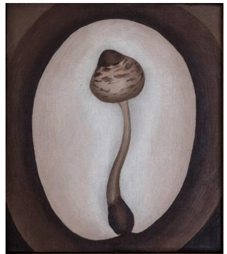
Toad Stool , c. 1932. Oil on canvas, 8 x 7 in. Anonymous Loan