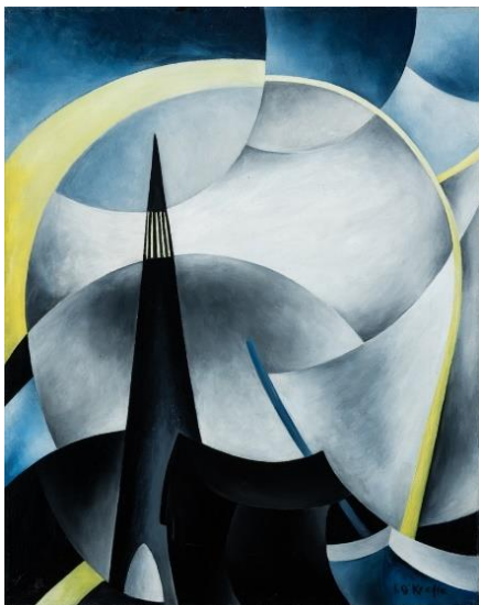
Variation on a Lighthouse Theme V , c. 1931-32. Oil on canvas, 20 x 16 in. Jeri L. Wolfson Collection