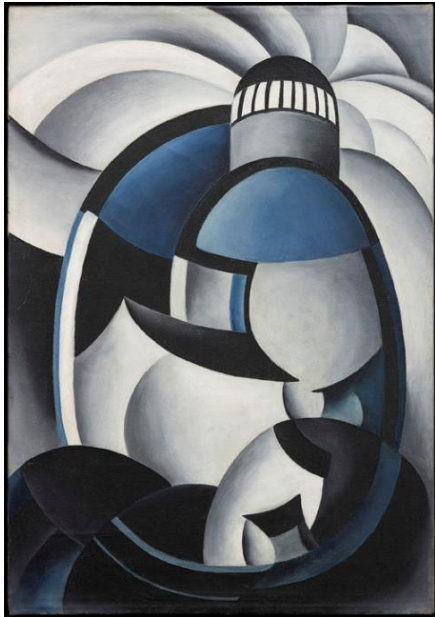
Variation on a Lighthouse Theme II , c. 1931-32. Oil on canvas, 20 x 14 in. Private collection, Dallas, Texas

All works, unless otherwise noted, by Ida Ten Eyck O'Keeffe (American, 1889–1961)