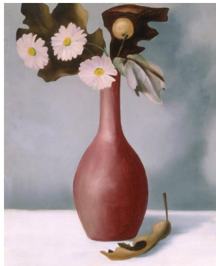
Peach-Blown Vase , 1927. Oil on canvas, 20 x 16 in. Peters Family Art Foundation