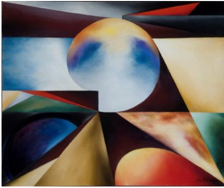
Creation , c. 1936. Oil on canvas, 23 x 28 in. Gerald Peters Gallery