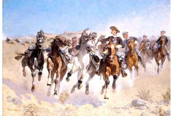
Dismounted—The Fourth Troopers Moving the Led Horses , 1890 by Frederic Remington Oil on canvas, 34 1/16 x 48 15/16 in. Sterling and Francine Clark Art Institute, Williamstown, Massachusetts