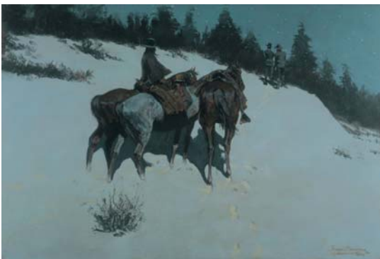
A Reconnaissance , 1902 by Frederic Remington Oil on canvas, 27 1/4 x 40 1/8 in. Private Collector