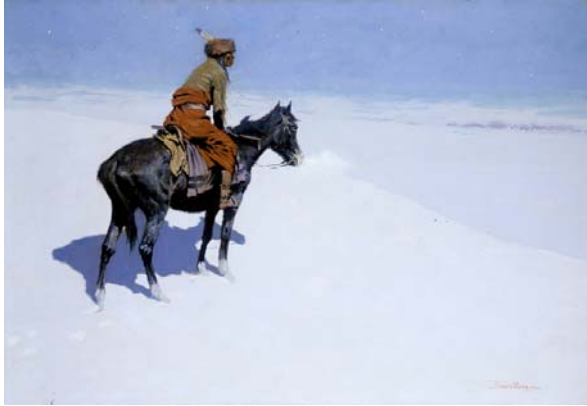
Friends or Foes? (The Scout) , c. 1900-05 by Frederic Remington Oil on canvas, 27 x 40 in. Sterling and Francine Clark Art Institute, Williamstown, Massachusetts

The following images are available as 300 dpi color jpeg files for press use in connection with the exhibition. To request images, contact Sarah Hoffman at 413-458-0471 or shoffman@clarkart.edu.