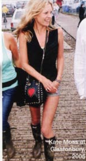
Kate Moss at Glastonbury, 2005

Don't miss the Bonnaroo Festival in Tennessee and the U.K.'s Glastonbury in June, followed by Chicago's Lollapalooza in August. On a more mellow note, Rufus Wainwright's latest album, All Days Are Nights: Songs for Lulu , is out now.