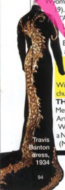
Travis Banton dress, 1934

19). ART MASTERS "Andy Warhol: The Last Decade" (June 18–Sept. 12) is at the Brooklyn Museum, and "Picasso Looks at Degas" (June 13–Sept. 12) debuts at the Clark Art Institute in Williamstown, Massachusetts. MADE IN THE U.S.A. New York's Metropolitan Museum of