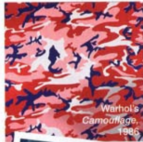
Warhol's Camouflage , 1966

ART MASTERS "Andy Warhol: The Last Decade" (June 18–Sept. 12) is at the Brooklyn Museum, and "Picasso Looks at Degas" (June 13–Sept. 12) debuts at the Clark Art Institute in Williamstown, Massachusetts. MADE IN THE U.S.A. New York's Metropolitan Museum of Art presents "American Woman: Fashioning a National Identity" (May 5–Aug. 15).