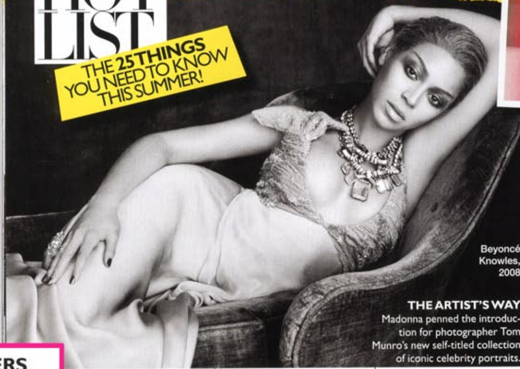
Beyoncé Knowles, 2008

THE 25 THINGS YOU NEED TO KNOW THIS SUMMER!