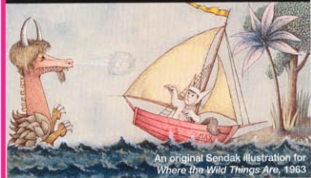
An original Sendak illustration for Where the Wild Things Are , 1963

THE RUMPUS BEGINS "Wild New Ways" showcases drawings by Maurice Sendak at the National Museum of Wildlife Art in Jackson Hole, Wyoming (May 15–Sept. 9).