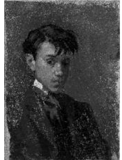
Pablo Picasso, Spanish, 1881-1973

LEFT: Self-Portrait , c 1857-58, by Edgar Degas (The Clark) RIGHT: Self-Portrait , 1896, by Pablo Picasso. Museu Picasso, Barcelona (MPB 110.076). © Museu Picasso, Barcelona / Ramon Mura / © 2010 Estate of Pablo Picasso / ARS, New York