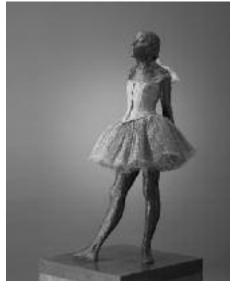
RIGHT: Little Dancer Aged Fourteen , 1879–81, by Edgar Degas (The Clark)

This sculpture belongs to the Clark. Usually, it's in the middle of Gallery 2 surrounded by Impressionist paintings. The curators decided to move Little Dancer from where it usually stands so it could be featured in this special exhibition.