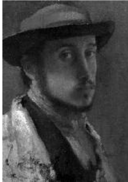
Edgar Degas, French, 1834-1917

Degas is best known for his paintings of ballerinas. Picasso, almost 50 years younger than Degas, is often called the greatest artist of the modern period. Although many suppose that there was no connection between these two very different artists, this exhibition explores the idea that Picasso was in fact significantly influenced by the work of Degas.