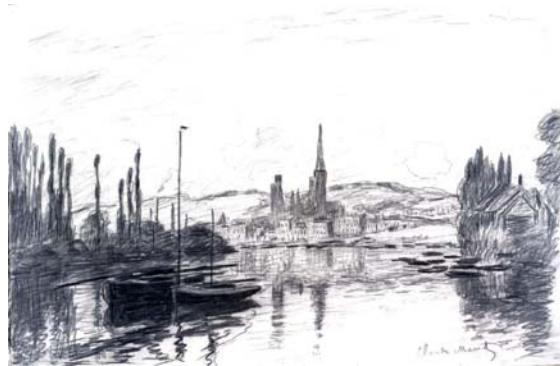
View of Rouen , 1883, by Claude Monet Black crayon and scratchwork on Gillot paper, 313 x 475 mm Sterling and Francine Clark Art Institute, Williamstown, Massachusetts