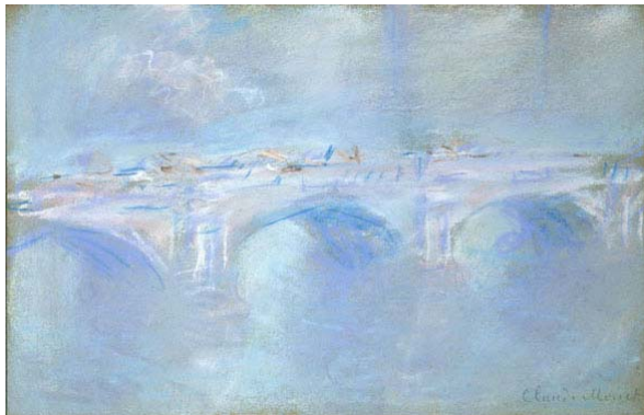
Waterloo Bridge , c. 1901, by Claude Monet Pastel, 305 x 480 mm Triton Foundation, The Netherlands