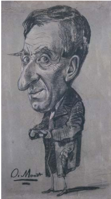
Caricature of a Man with a Snuff Box , c. 1858, by Claude Monet Charcoal heightened with white chalk on blue laid paper (discolored to gray), 588 x 330 mm Sterling and Francine Clark Art Institute, Williamstown, Massachusetts