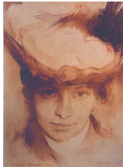
Portrait of a Woman , c. 1890-95, by Claude Monet Red chalks with stumping, 285 x 210 mm Private collection