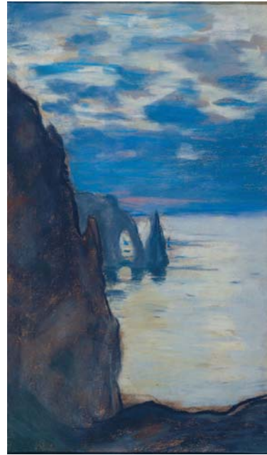
Étretat, the Needle Rock and Porte d'Aval , c. 1885, by Claude Monet Pastel on tan paper, 400 x 235 mm Private collection