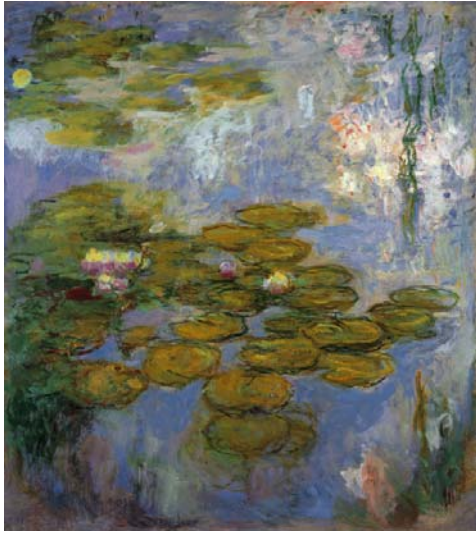
Water Lilies , 1916-19, by Claude Monet Oil on canvas, 200 x 180 cm Fondation Beyeler, Riehen/Basel

The following images are available as 300 dpi color jpeg files for press use in connection with the exhibition. To request images, contact pr@clarkart.edu or 413-458-0471.