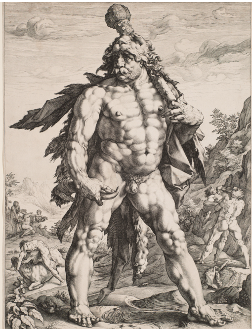
Hendrick Goltzius, The Great Hercules , 1589. Engraving on paper. Acquired by the Clark, 1996. 1996.11.

What is the first thing you notice when you look at this image?