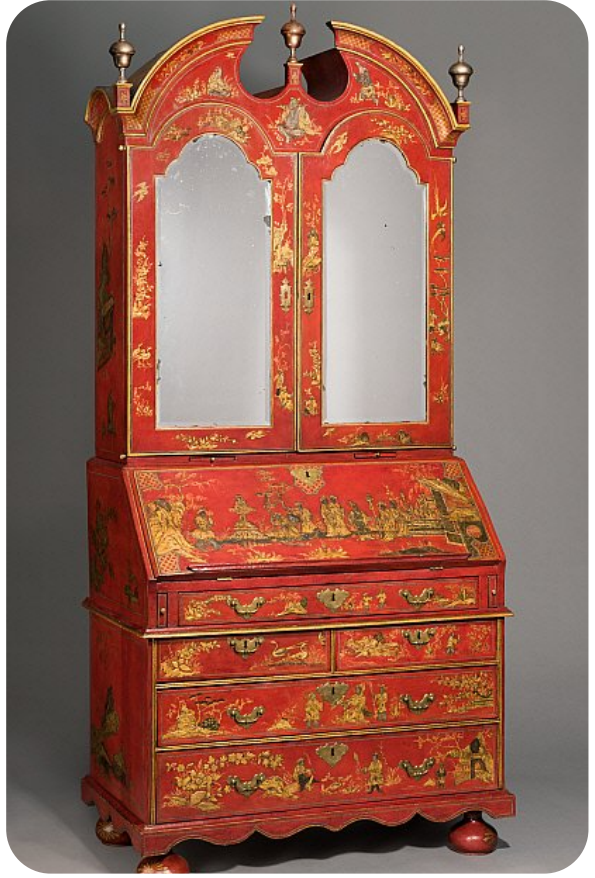
Unknown, "Japanned" Bureau Cabinet, c. 1720. Oak wood veneer (probably pear), pine, red and black pigments and varnish, areas of raised gesso, silvered, gilt, and painted decoration, brass. Acquired by the Clark, 2018. 2018.7.