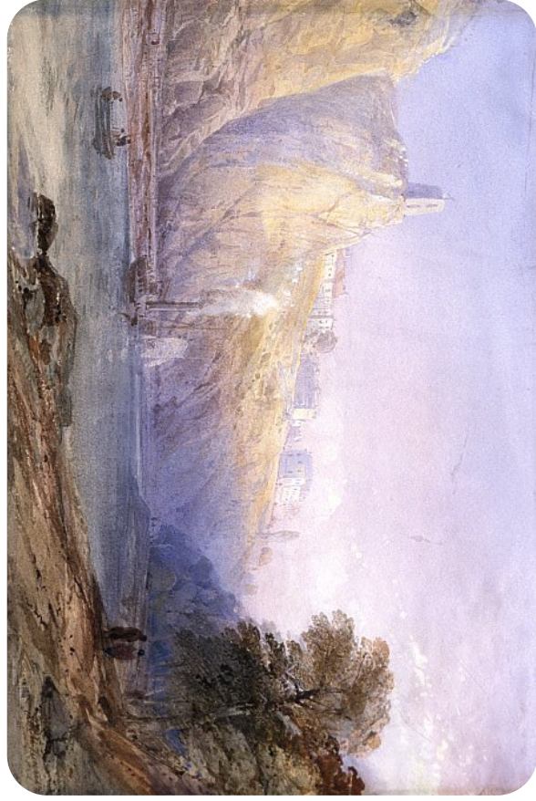
Purportedly Joseph Mallord William Turner, Clifton, Gloucestershire , mid-19th century. Watercolor and body color on wove paper. Acquired by Sterling and Francine Clark before 1955. 1955.1963.