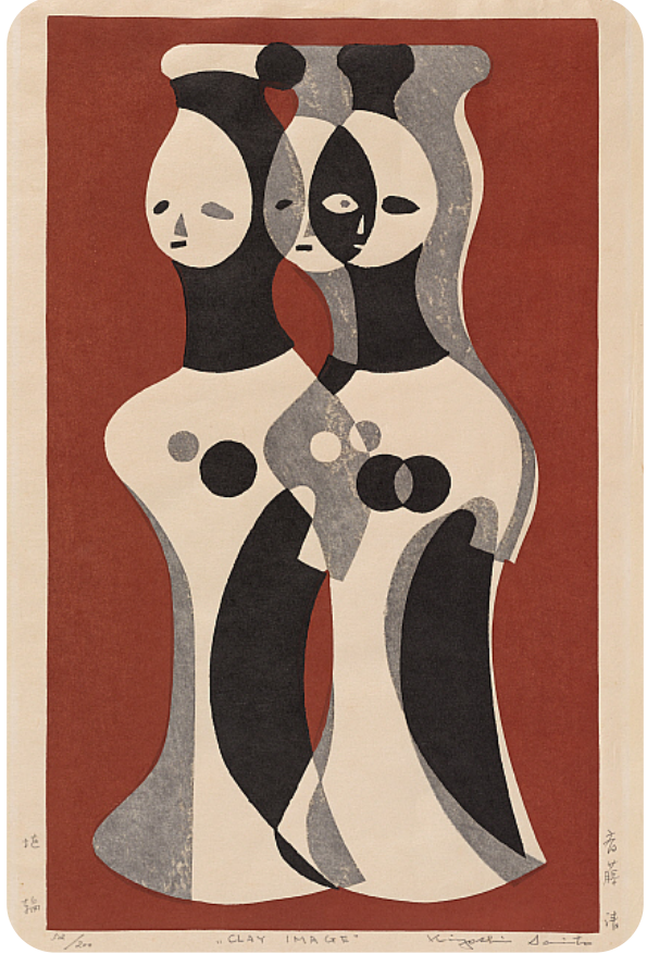
Saito Kiyoshi, Clay Image , 1959. Color woodblock print. Gift of the Rodbell Family Collection, 2014. 2014.16.60.