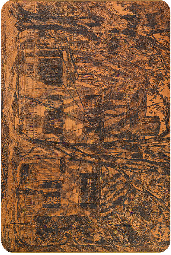
Childe Hassam, The Lion Gardiner House, Easthampton, Long Island , published 1920. Etching on paper. Acquired by Sterling and Francine Clark before 1955. 1955.984.