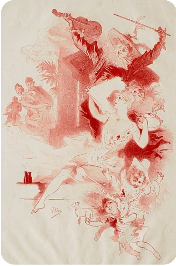
Jules Chéret, Columbine and Harlequin , 1846–1932. Lithograph in sanguine on paper. Acquired by Sterling and Francine Clark before 1955. 1955.2392.