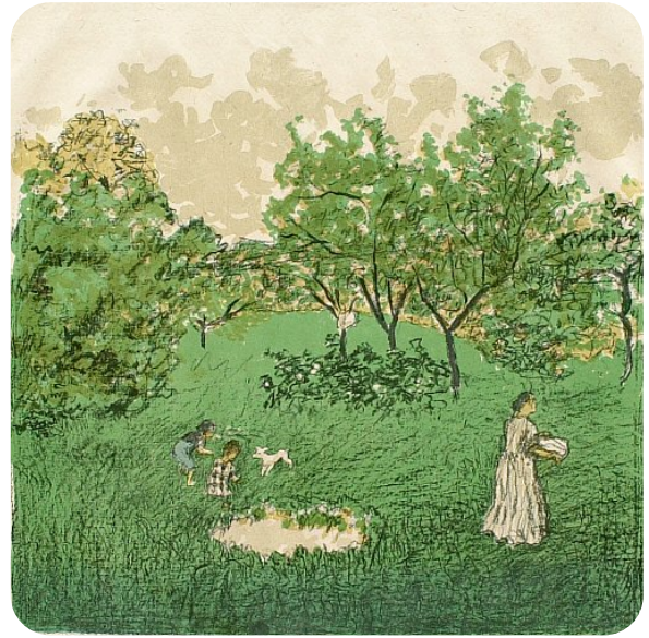
Pierre Bonnard, The Orchard (Le verger) , 1899. Lithograph in green, light blue, yellow, beige, black on China paper. Acquired by the Clark, 1962, 1962.10.