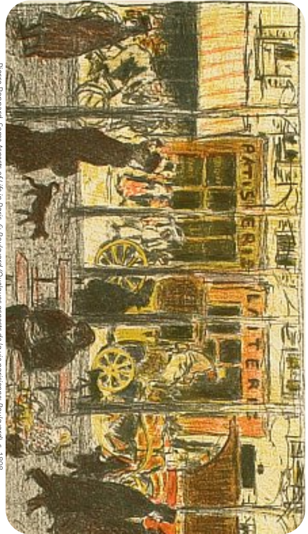
Pierre Bonnard, Some aspects of life in Paris. 6. Boulevard (Quelques aspects de la vie parisienne Boulevard) , c. 1898. Lithograph in gray/green, grayish black, yellow, orange on wove paper. Acquired by the Clark, 1962, 1962.12.