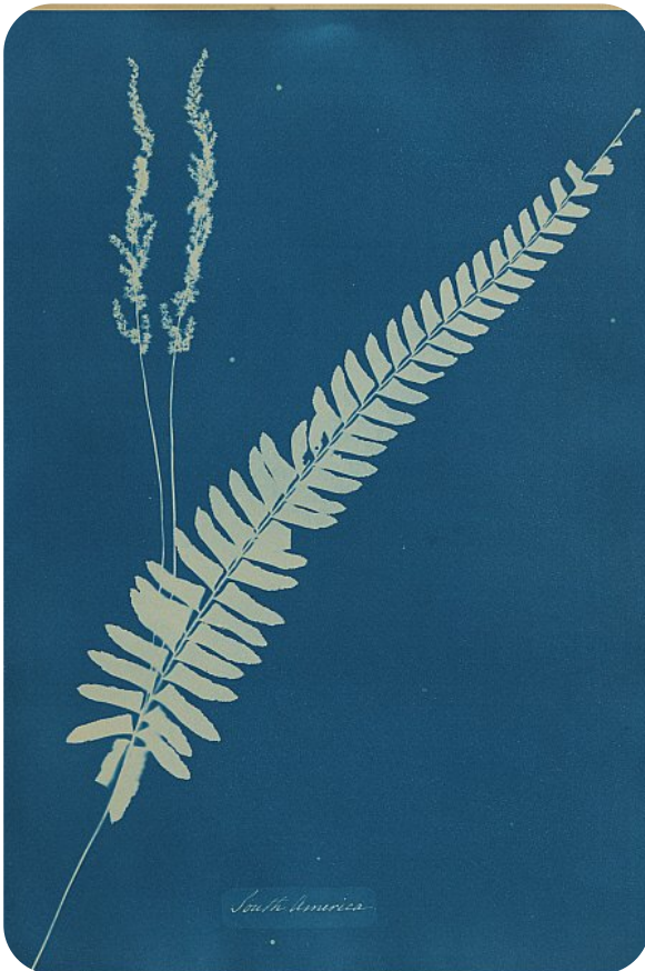
Anna Atkins, South America , 1851–1854. Cyanotype. Acquired by the Clark, 2004, 2004.2.