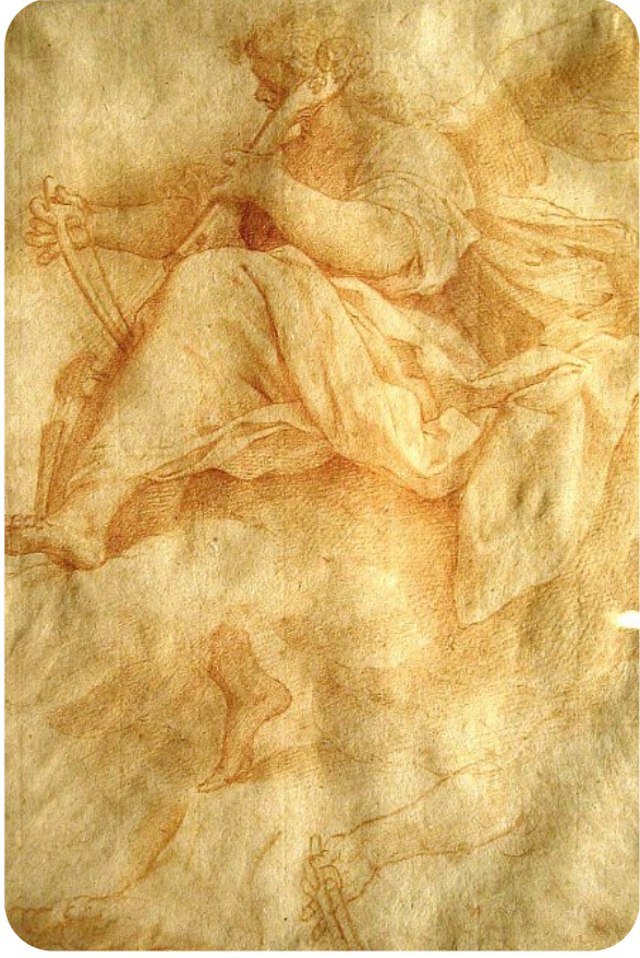
Cristoforo Roncalli, Studies of an Angel Playing a Viola da Gamba , c. 1610. Red chalk on paper. Acquired by the Clark, 2003, 2003.9.8.