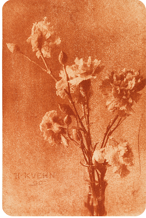
Heinrich Kuhn, Still Life with Carnations , 1896. Red gum bichromate print on paper. Acquired by the Clark, 2013. 2013.8.