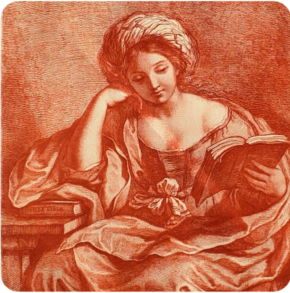
Francesco Bartolozzi, The Libyan Sibyl , c. 1780. Etching in red ink on laid paper. Acquired with funds donated by participants in the Friends of the Clark Print Seminar, 1984, 1984. 1984.75A.