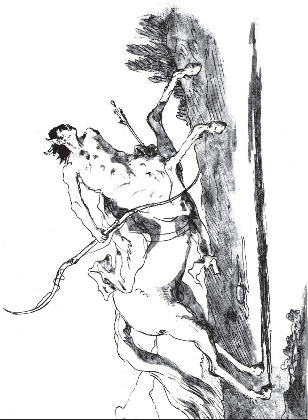
Giovanni Domenico Tiepolo (Italian, 1727–1804), Galloping Centaur (c. 1755–1765) Pen and brown ink with wash on paper

Giovanni Domenico Tiepolo loved to draw centaurs, fauns, satyrs, and other mythological creatures. What fantastic friends is this centaur running to meet? Add them to the scene!